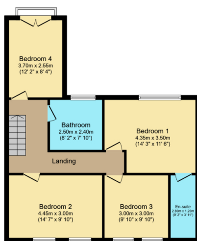
First Floor Floor area 68.4 sq.m. (736 sq.ft.)

Total floor area: 156.8 sq.m. (1,688 sq.ft.)