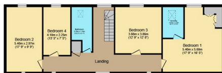
First Floor Floor area 97.0 sq.m. (1,044 sq.ft.)

Total floor area: 198.6 sq.m. (2,137 sq.ft.)