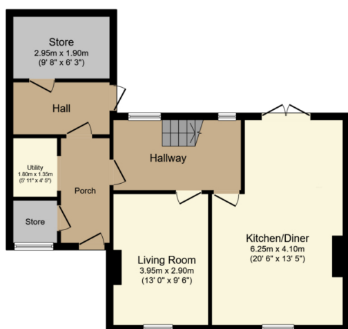
Ground Floor Floor area 64.5 sq.m. (694 sq.ft.)