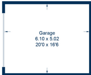
(Not Shown In Actual Location / Orientation)