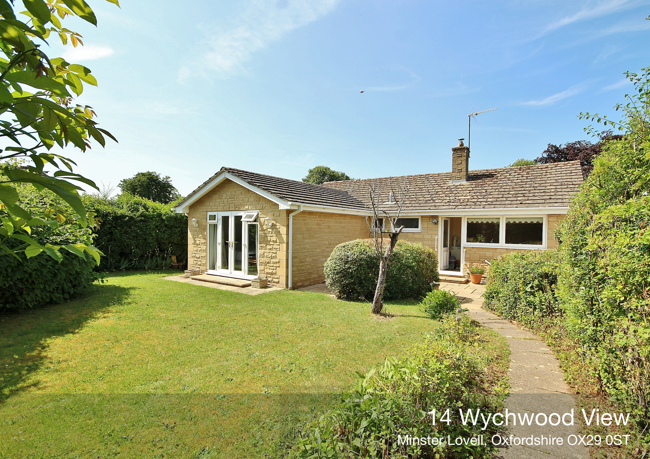
14 Wychwood View Minster Lovell, Oxfordshire OX29 0ST