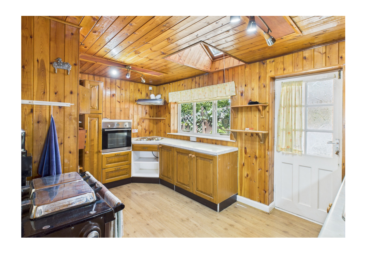
Charming Two-Bedroom Bungalow with Exceptional Gardens on Carr Hill Lane, Briggswath.