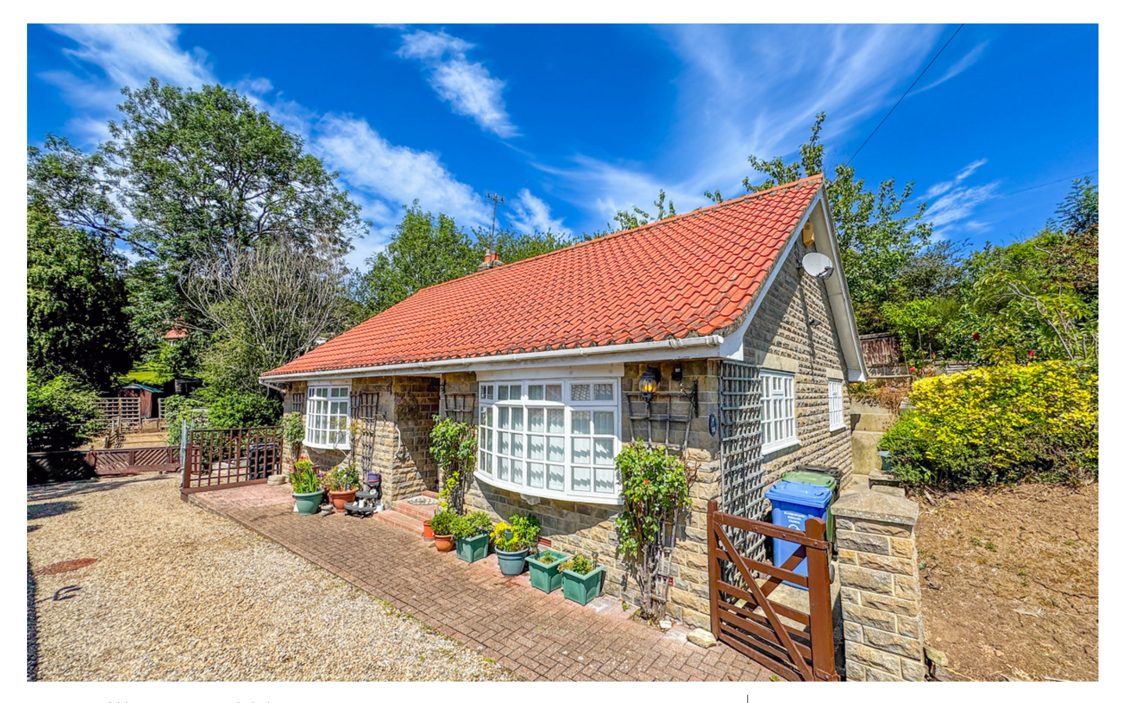
Carr Hill Lane, Whitby, YO21