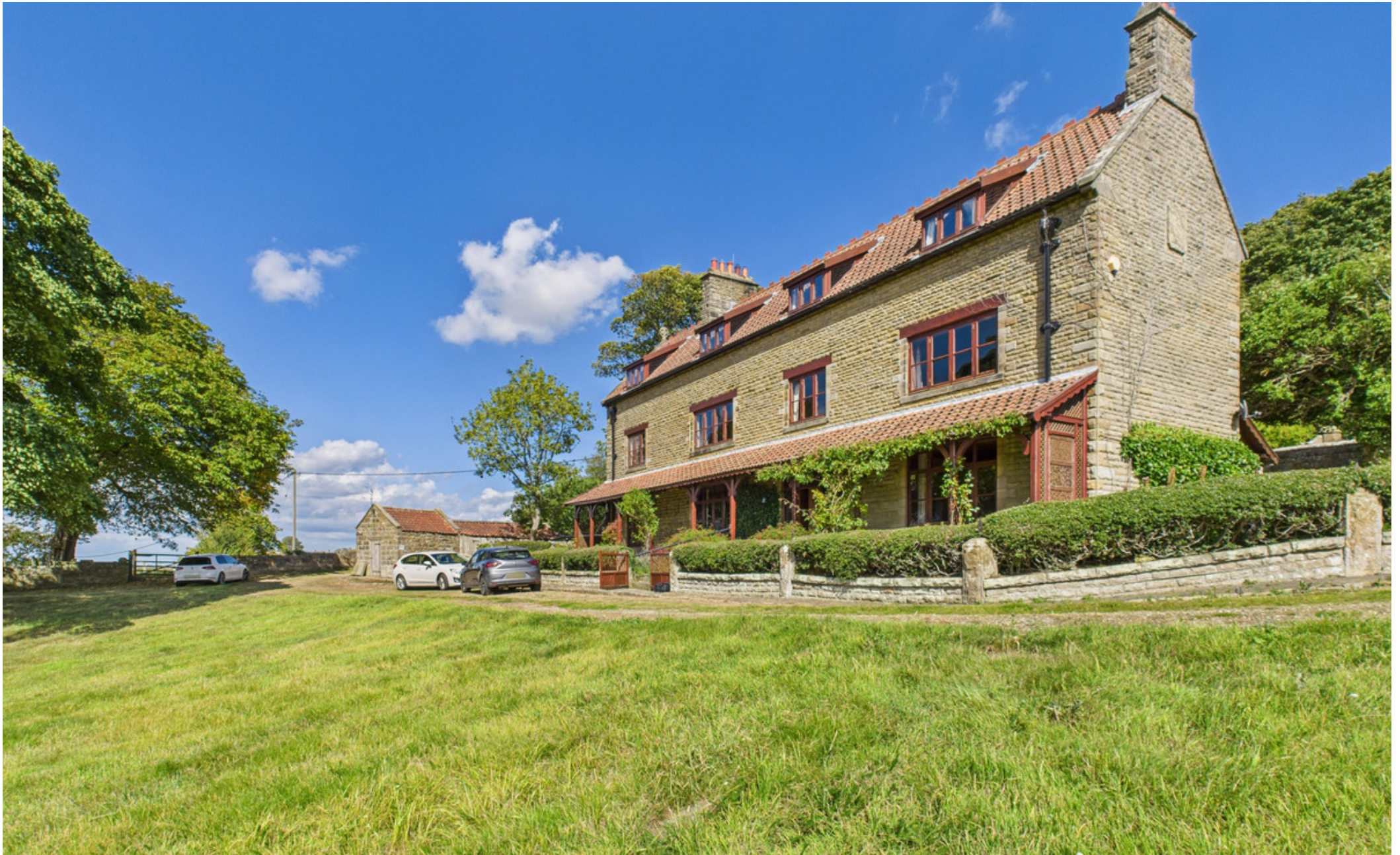
Hempsyke Hall, Littlebeck, YO22 £2,500 per month