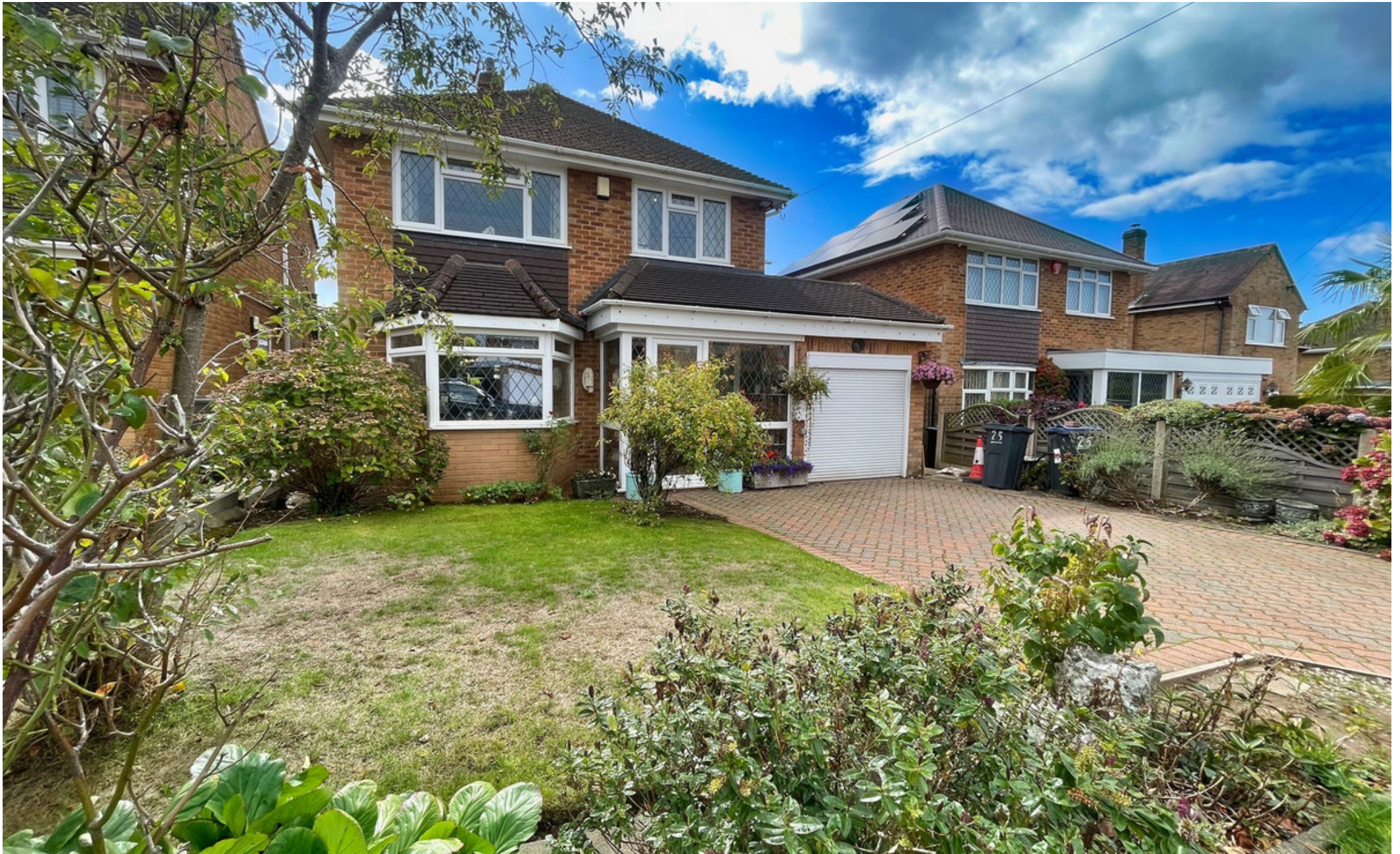
Moor Meadow Road, Sutton Coldfield, B75 6