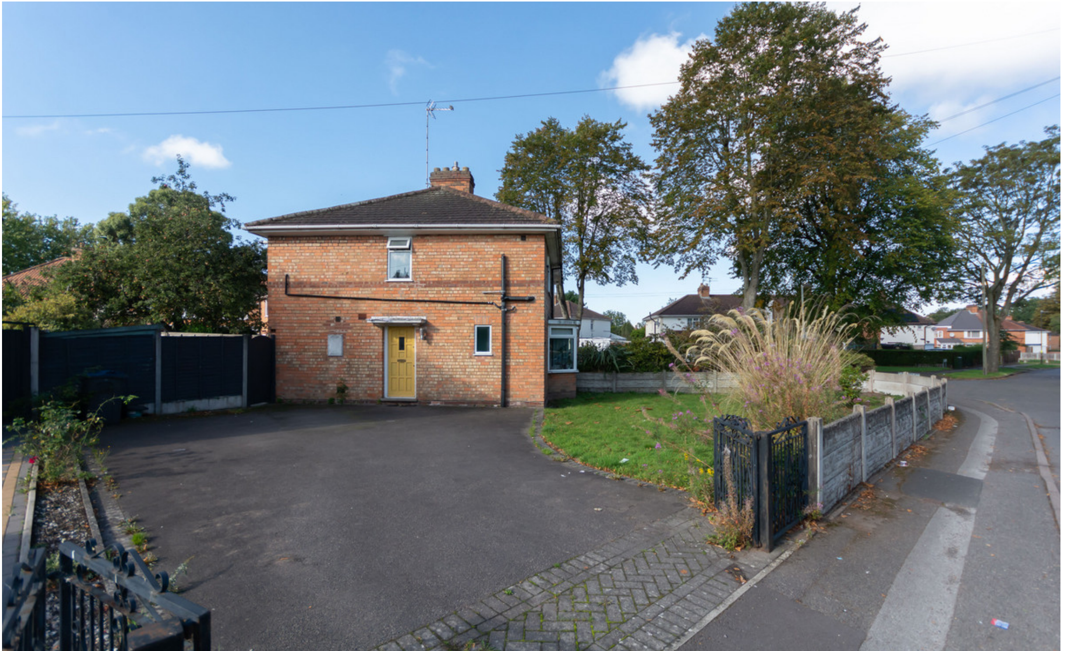
Ferris Grove, Acocks Green, Birmingham